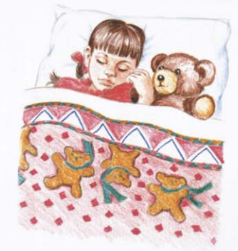
by Uncle Arthur