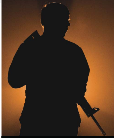
In its extreme, can fear of the 'other' lead to this? What is the true Christian view of the 'other'?