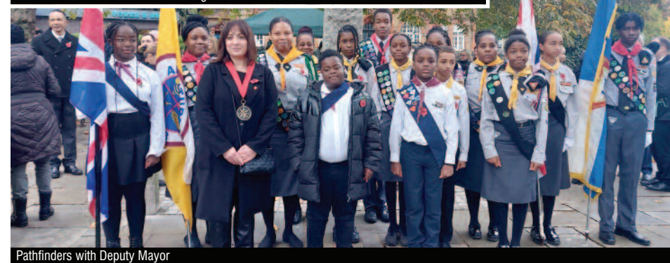
Pathfinders with Deputy Mayor